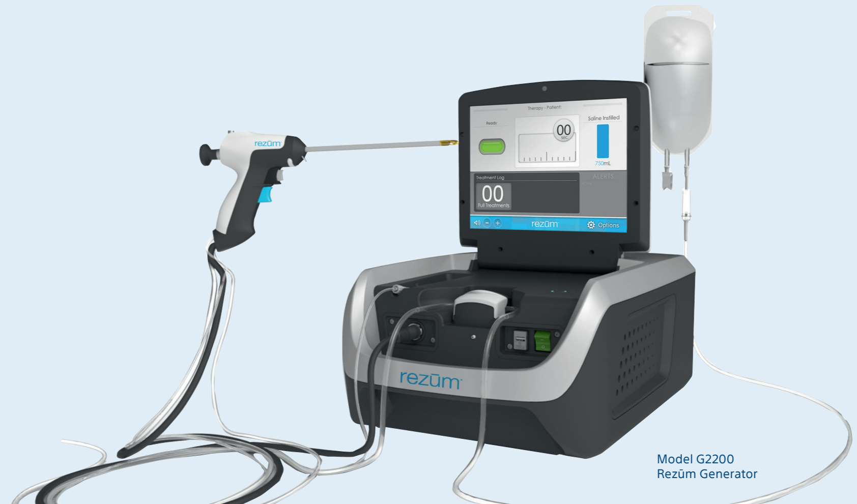
Model G2200 Rezūm Generator

Over time, this ablated tissue is reabsorbed by the body's natural healing response, reducing the volume of tissue allowing the urethra to open relieving LUTS.